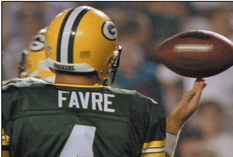
All is well... celebrity endorsement