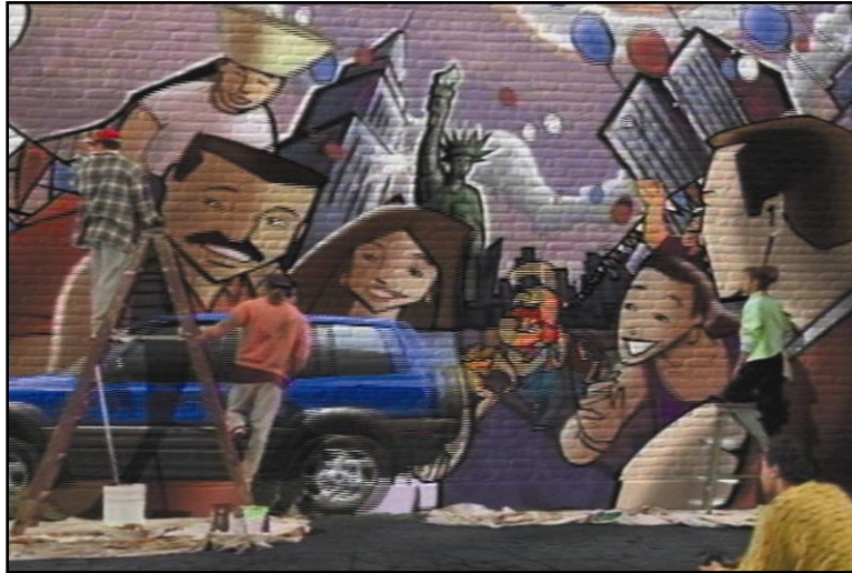
New York departure Live action with digital composite