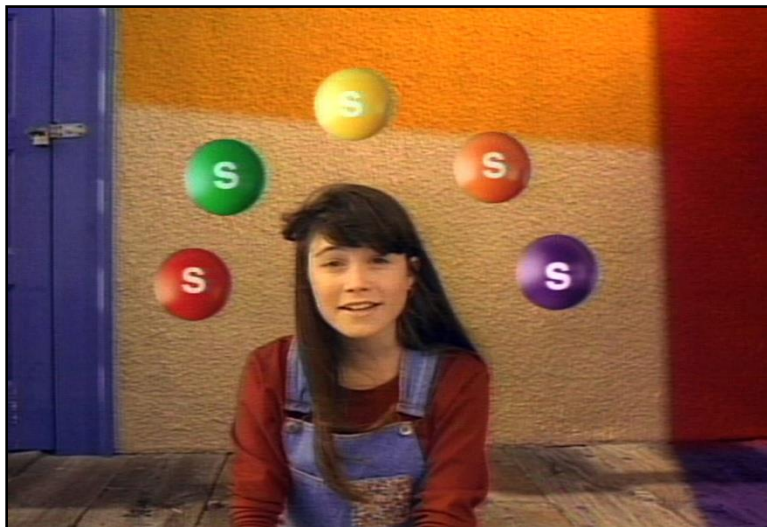
Live-action stop motion animation composite "Taste the Rainbow"