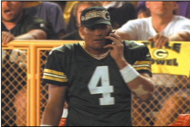
Brett Favre - Lambo field Brett has a problem.