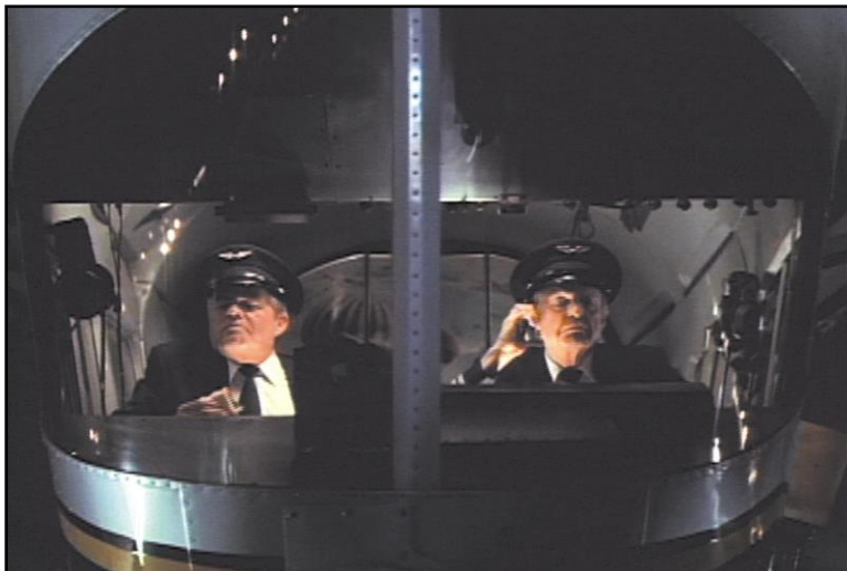
Goodyear blimp - tethered On call air assist