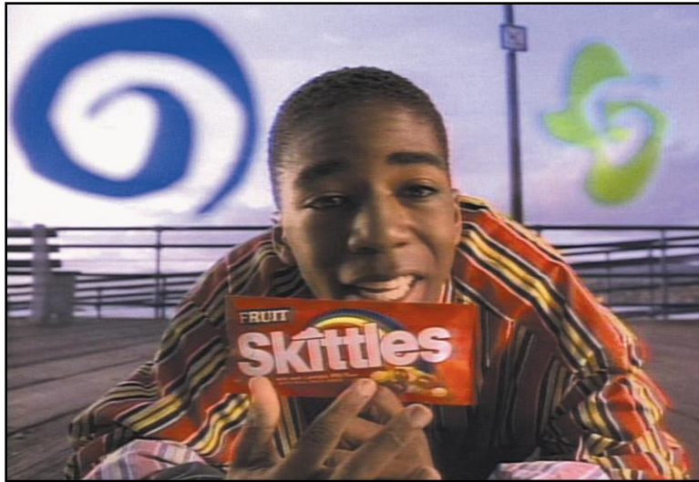
Live action - product integration In-camera visual design elements