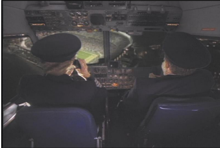
Goodyear blimp - interior Stadium composite