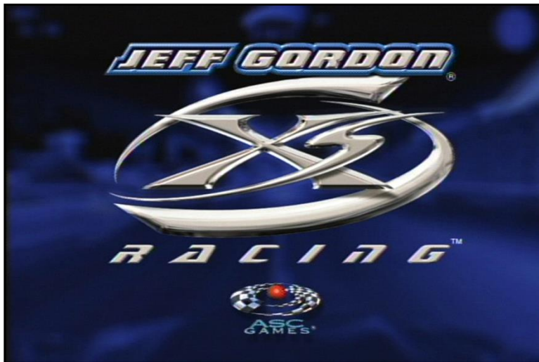
Jeff Gordon XS Racing Logo