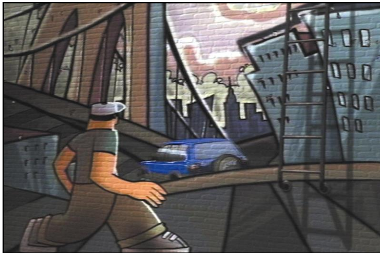
New York drive by Digital composite