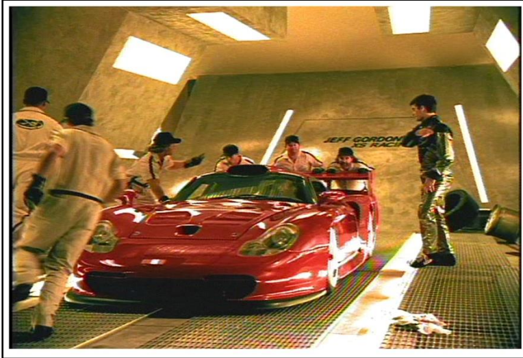
Jeff Gordon circa 2012 Location Installation - Miami, Florida