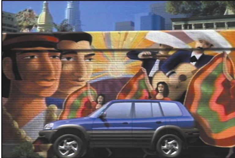
Los Angeles arrival Digital composite